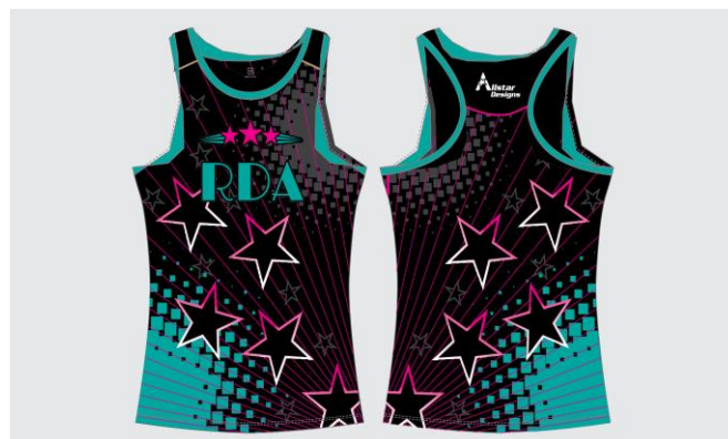
Vest top: YXS – YL £25 Vest top: AXS – AL £29