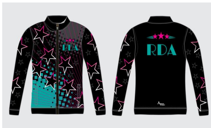
Jacket: YXS – YL £35 Jacket: AXS – AL £39