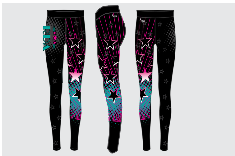
Leggings: YXS – YL £29 Leggings: AXS – AL £34