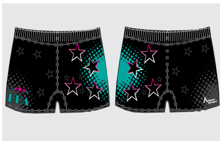
Hotpants: YXS – YL £23 Hotpants: AXS – AL £27