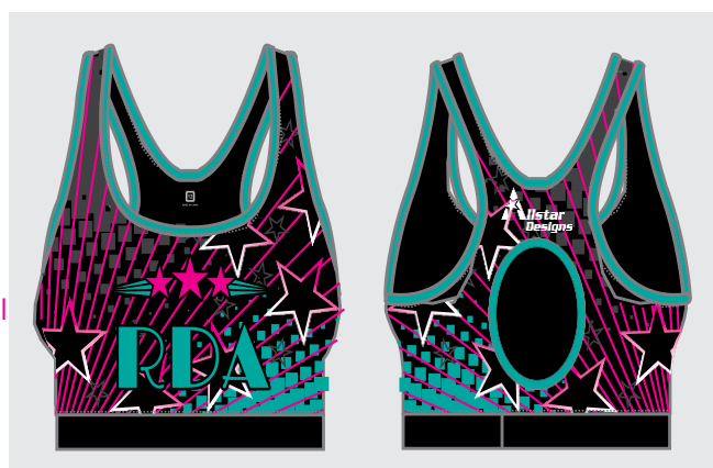
Crop top: YXS – YL £23 Crop top: AXS – AL £27