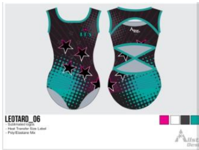
Leotard 06: YXS – YL £37 Leotard 06: AXS – AL £43